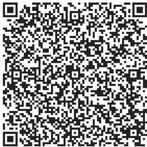
Waiatarua Nov2021 Abbotts way, Ellerslie, Auckland

Scan in with the NZ COVID Tracer app Matawhaitia te QR Code